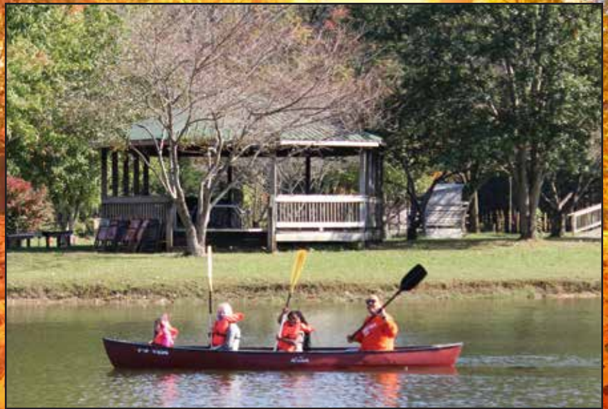
TNT youth enjoyed the great outdoors during fall break.