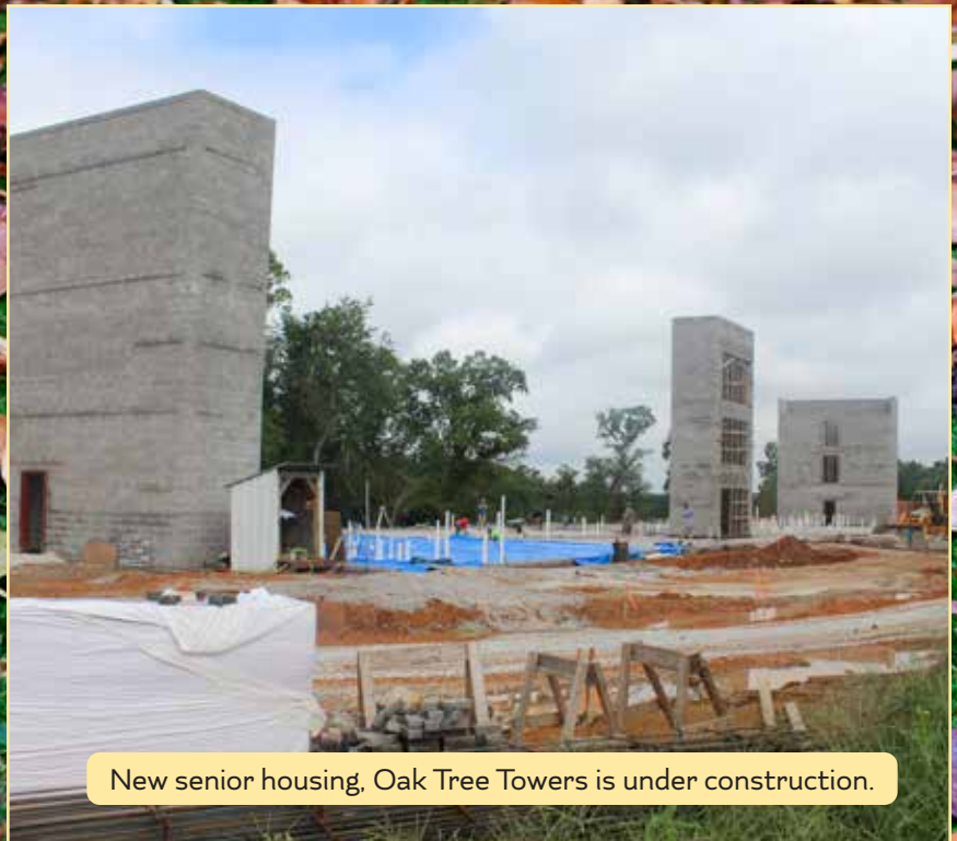
New senior housing, Oak Tree Towers is under construction.