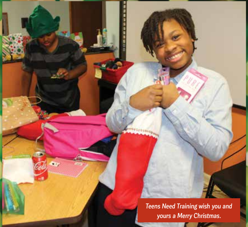
Teens Need Training wish you and yours a Merry Christmas.

The Board of Commissioners and staff of Highlands Residential Services would like to wish each of you happy holidays and a joyous new year!